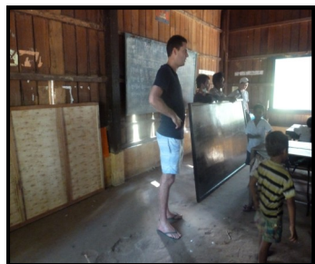
A new blackboard for a school near Kampong Thom June 2013